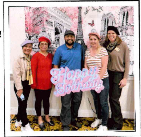
Happy birthday to our December birthdays!